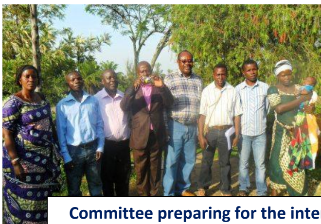
Committee preparing for the international meeting of November 2013