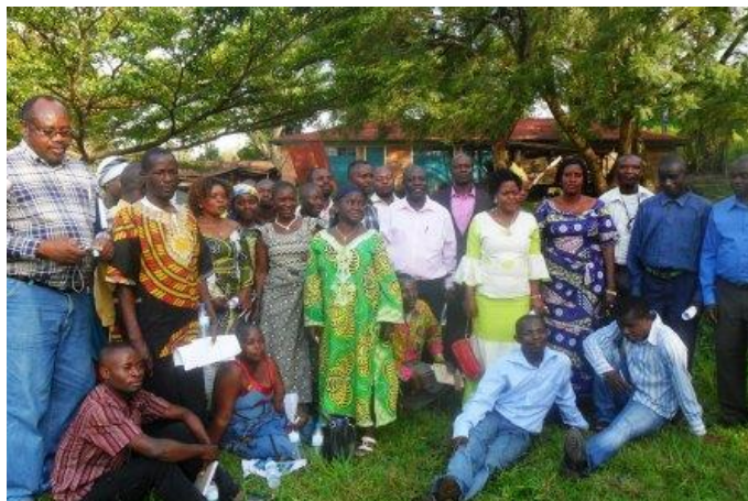
Participants of the Training session